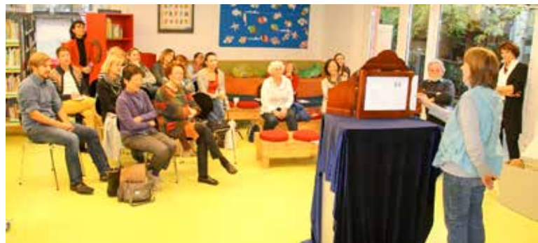
A German participant's first attempt at performing kamishibai.

In October, I held a kamishibai seminar at the Bensheim City Library in a suburb of Frankfurt. The seminar was timed to coincide with a donation of twelve kamishibai works and a stage from the group Karl Kübel Stiftung für Kind und Familie (Karl Kübel Stiftung Organization for Children and Families). I shared with the audience about kamishibai as a culture of kyokan . The audience consisted mainly of early childhood educators, many of whom were seeing kamishibai for the first time. They talked excitedly afterward about potential uses of kamishibai in awakening interest in language, and in integrating children of refugees, whose numbers have risen sharply.