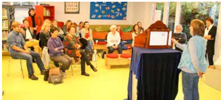
A German participant's first attempt at performing kamishibai.

In October, I held a kamishibai seminar at the Bensheim City Library in a suburb of Frankfurt. The seminar was timed to coincide with a donation of twelve kamishibai works and a stage from the group Karl Kübel Stiftung für Kind und Familie (Karl Kübel Stiftung Organization for Children and Families). I shared with the audience about kamishibai as a culture of kyokan . The audience consisted mainly of early childhood educators, many of whom were seeing kamishibai for the first time. They talked excitedly afterward about potential uses of kamishibai in awakening interest in language, and in integrating children of refugees, whose numbers have risen sharply.